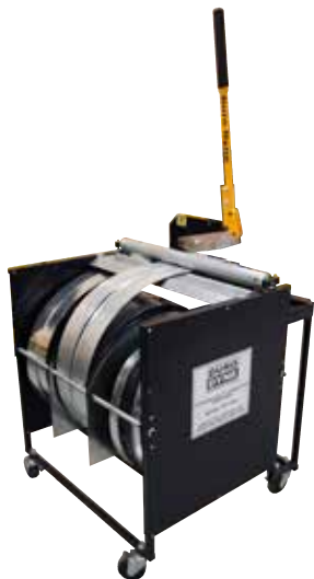
ITEM# 43008 FDCAB3 WITH SHEAR

For safety, the FDCS-12 has a safety pin to lock the shear in the open position and hold the 30" long handle upright and out of the way.