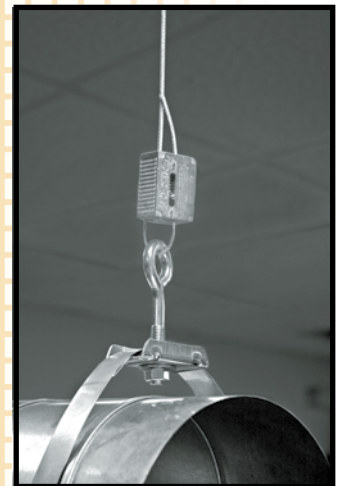
Spiral Buckle with eye bolt and the Dyna-Tite Wire Rope Suspension System