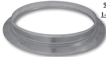
90 DEGREE 1-1/2" X 1-1/2"